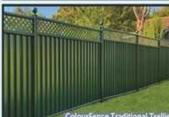
ColourFence Traditional Trellis