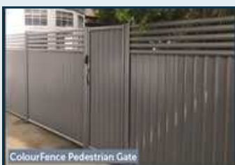
ColourFence Pedestrian Gate