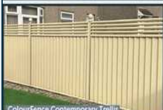
ColourFence Contemporary Trellis