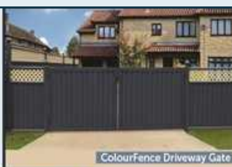
ColourFence Driveway Gate