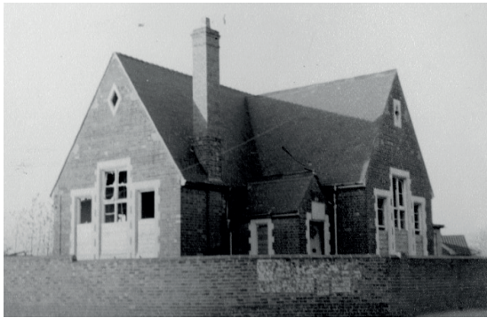
The old Wood End infant School built 1875